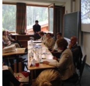
Breakout Session at EFA 2015

WWWforEurope researchers and board members took part in a variety of panels, break-out sessions, and seminars, all on this year's theme "InEquality" at the 2015 European Forum Alpbach. Some of the topics: "Intergenerational Justice and Economic Outcomes", "The End of Energy Revolution", "How to Grow or Not to Grow – that is the Question!"