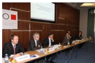
Policy panel at the conference